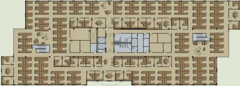
Single Tenant Floor Plan