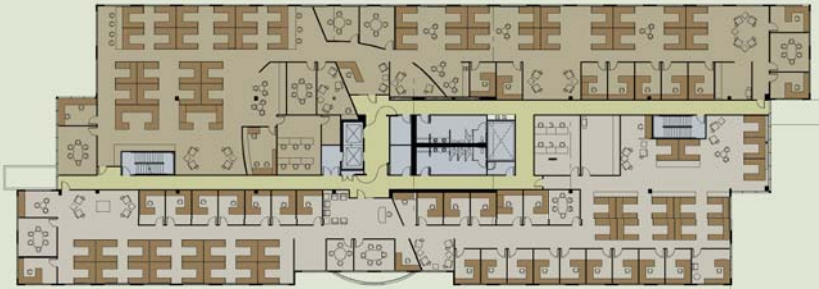
Multi-Tenant Floor Plan